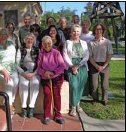
"The Orange County Historical Commission (OCHC) paid a special visit to the Museum in November."