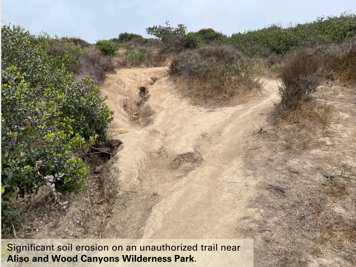
Significant soil erosion on an unauthorized trail near Aliso and Wood Canyons Wilderness Park.