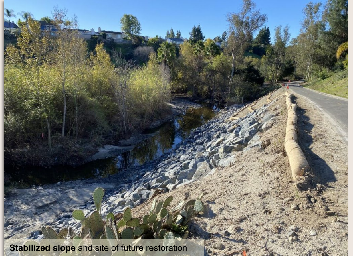
Stabilized slope and site of future restoration