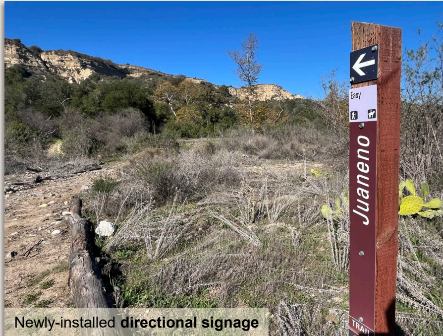
Newly-installed directional signage