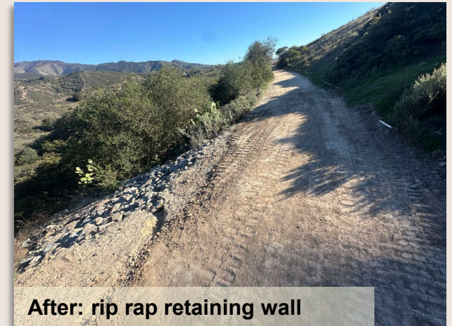
After: rip rap retaining wall