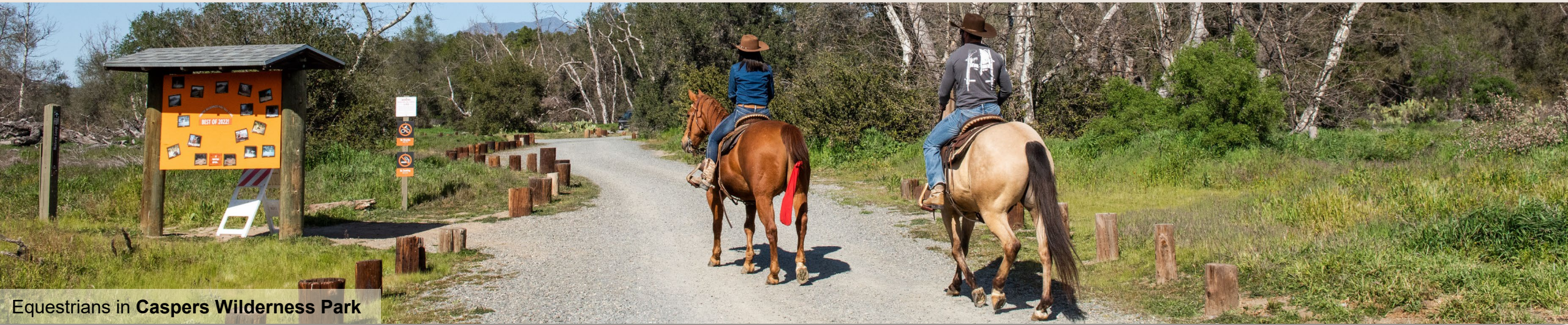
Equestrians in Caspers Wilderness Park