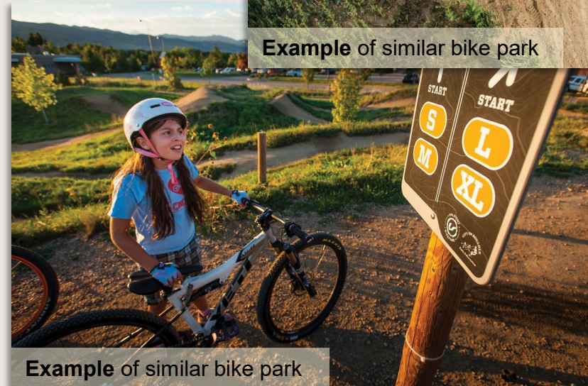
Example of similar bike park