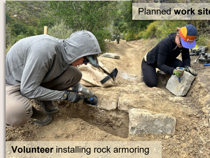
Volunteer installing rock armor