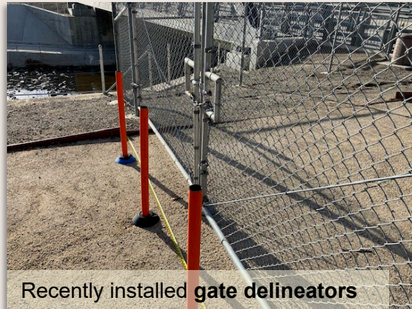
Recently installed gate delineators