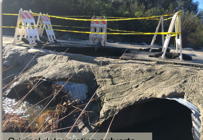
Original deteriorating culverts