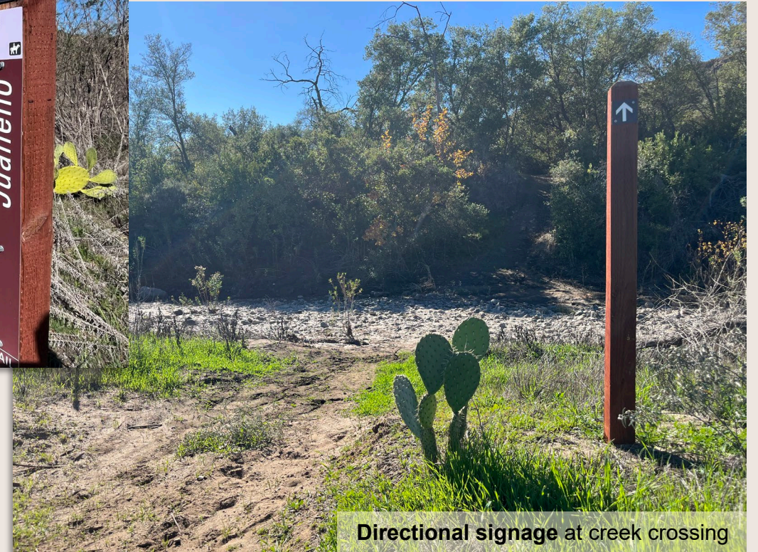
Directional signage at creek crossing