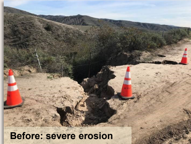
Before: severe erosion