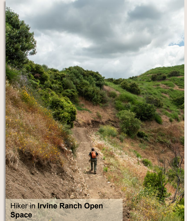
Hiker in Irvine Ranch Open Space