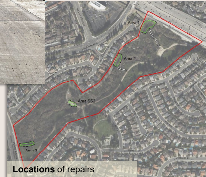
Locations of repairs