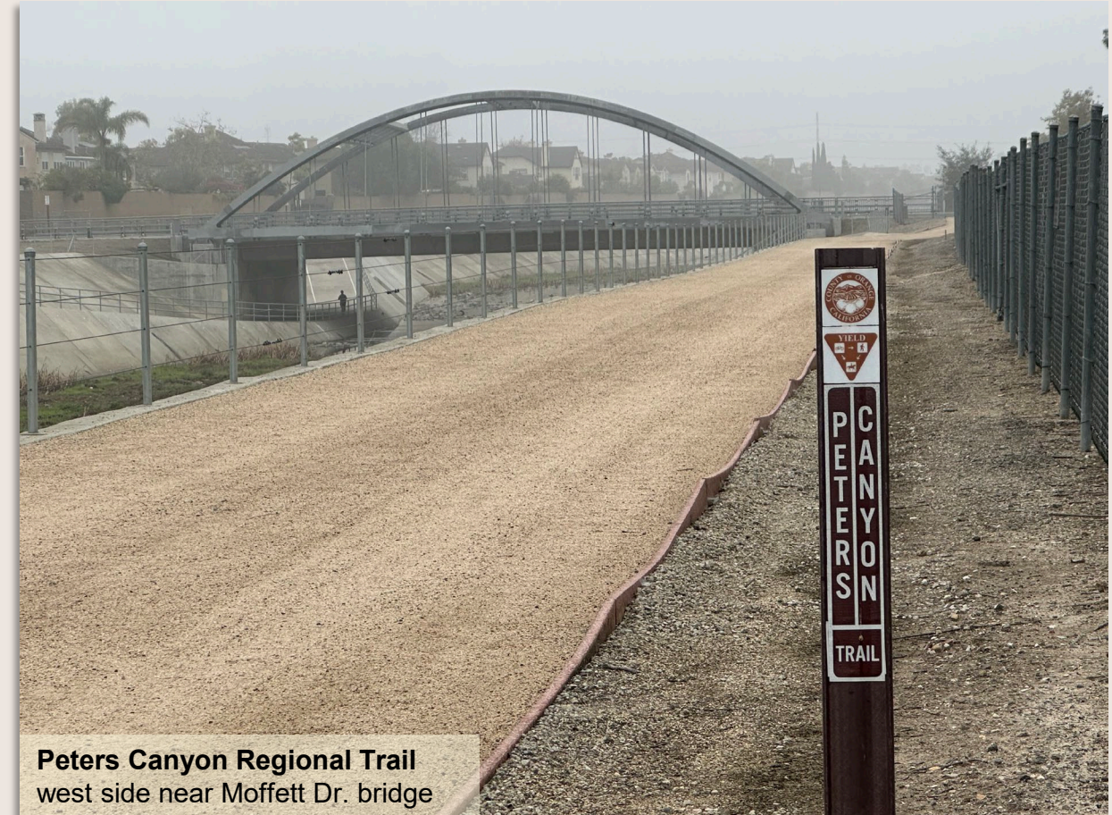
Peters Canyon Regional Trail west side near Moffett Dr. bridge