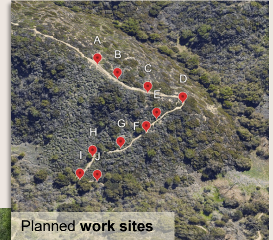
Planned work sites