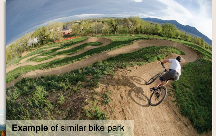
Example of similar bike park