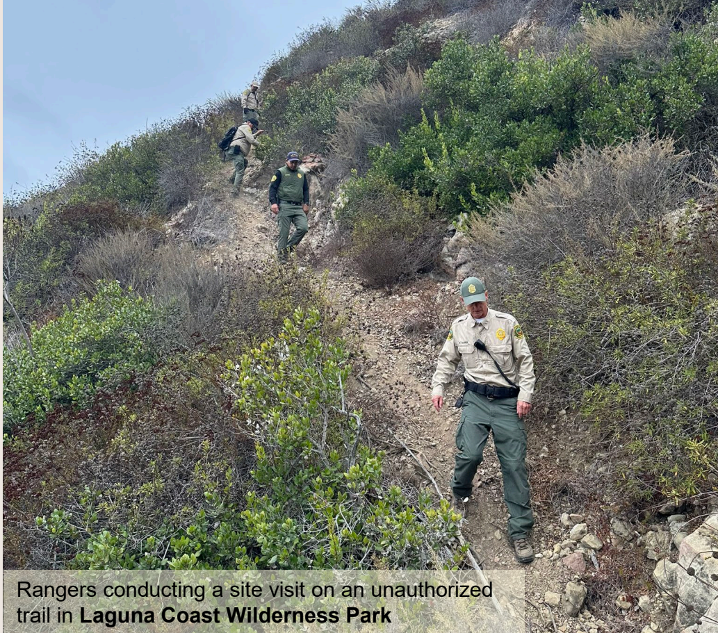
Rangers conducting a site visit on an unauthorized trail in Laguna Coast Wilderness Park