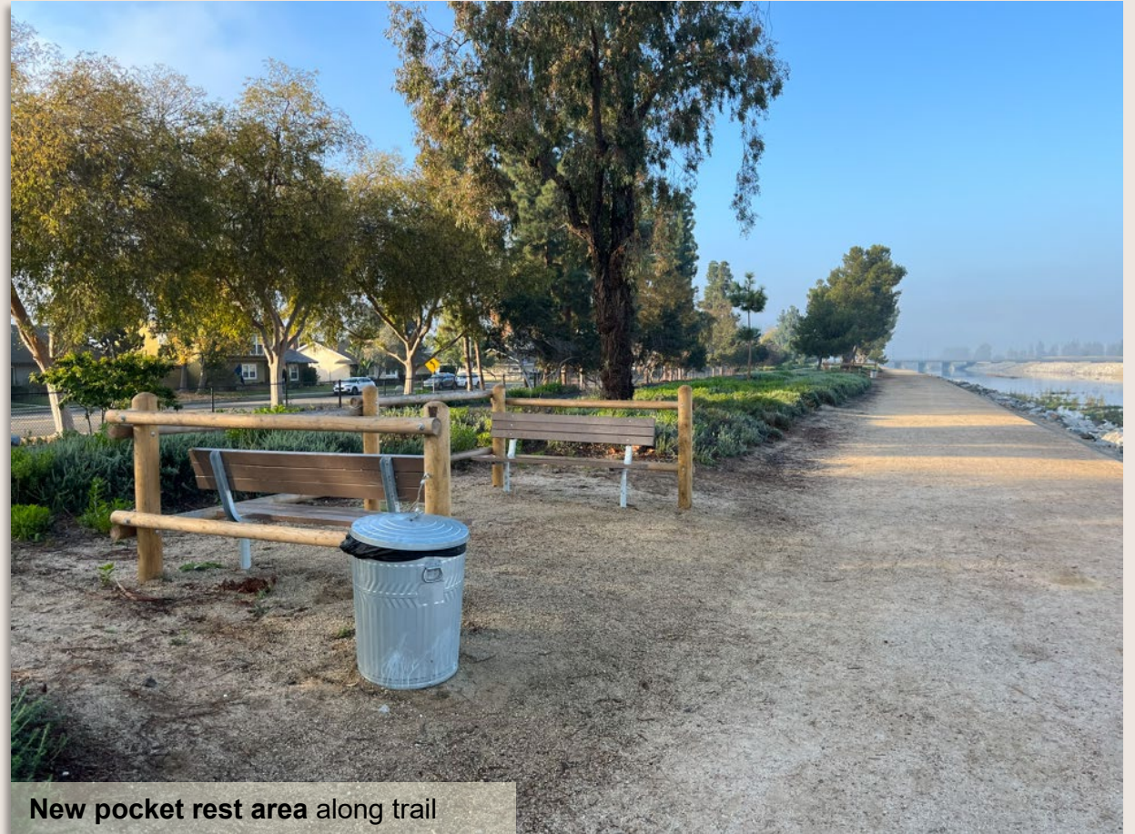
New pocket rest area along trail