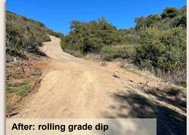
After: rolling grade dip