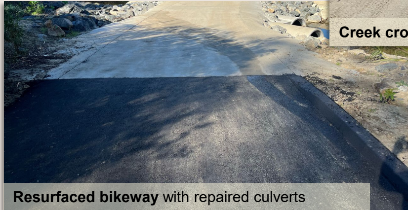
Resurfaced bikeway with repaired culverts