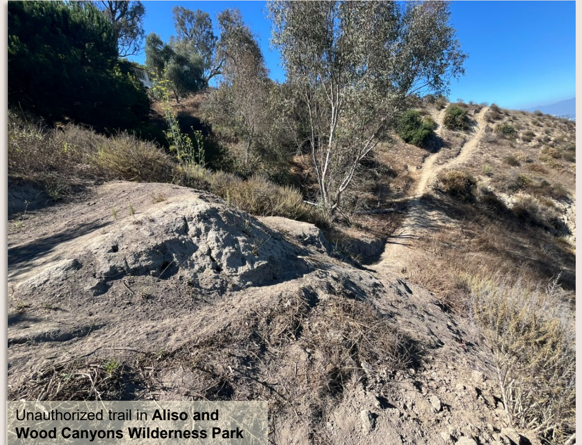
Unauthorized trail in Aliso and Wood Canyons Wilderness Park

Provide feedback on the draft overview of Unauthorized Trail Decommissioning Guidelines for OC Parks' consideration