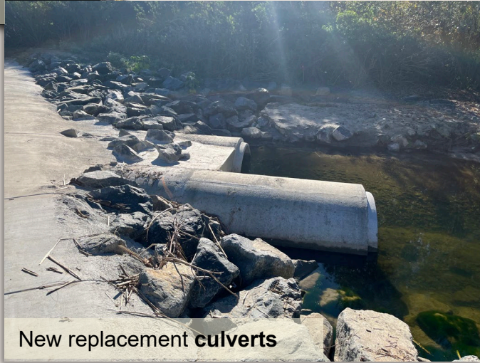
New replacement culverts