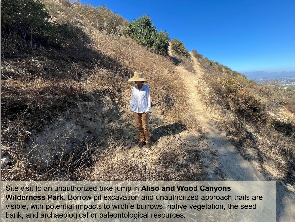
Site visit to an unauthorized bike jump in Aliso and Wood Canyons Wilderness Park . Borrow pit excavation and unauthorized approach trails are visible, with potential impacts to wildlife burrows, native vegetation, the seed bank, and archaeological or paleontological resources.