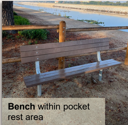
Bench within pocket rest area