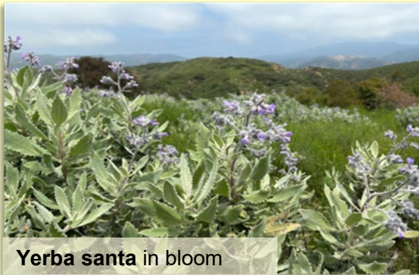
Yerba santa in bloom