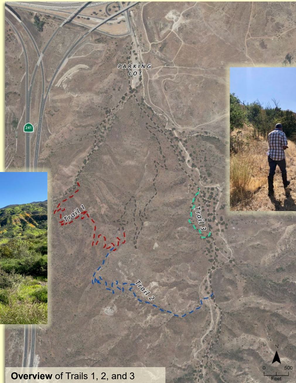
Overview of Trails 1, 2, and 3