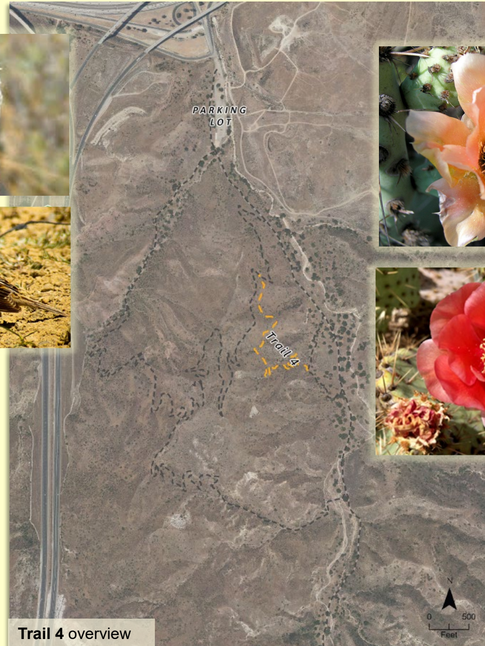
Trail 4 overview