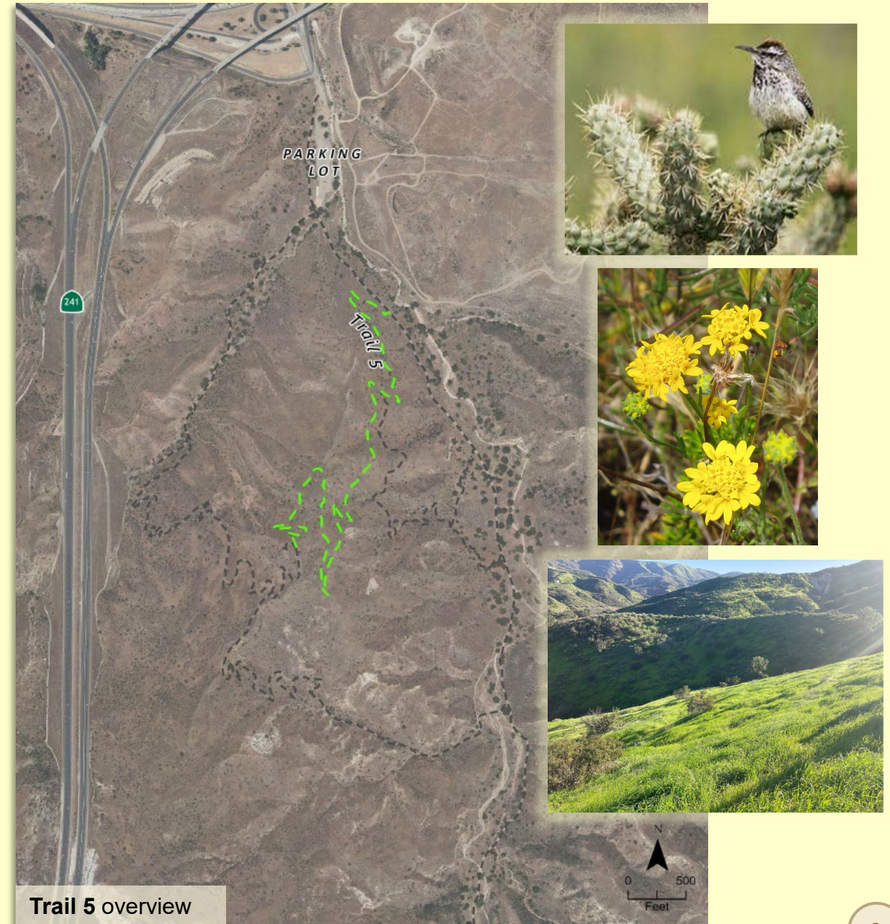
Trail 5 overview