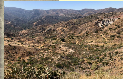
Trail 2 overview