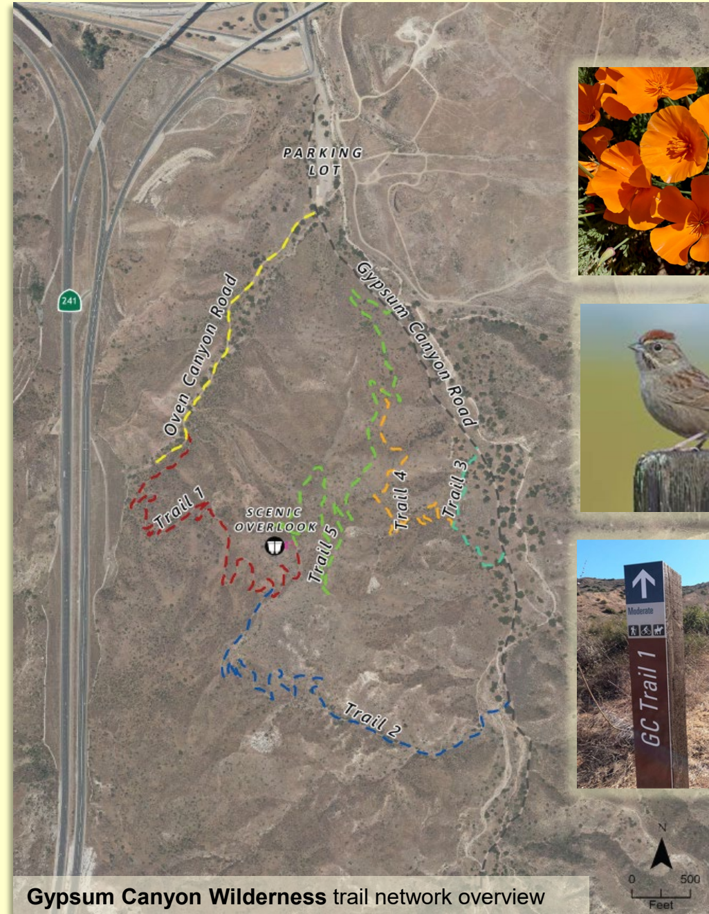
Gypsum Canyon Wilderness trail network overview

The park opened to the public in October 2023, and visitors were invited to offer naming suggestions for five unnamed trails.