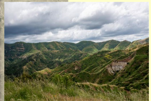
Trail 1 overview