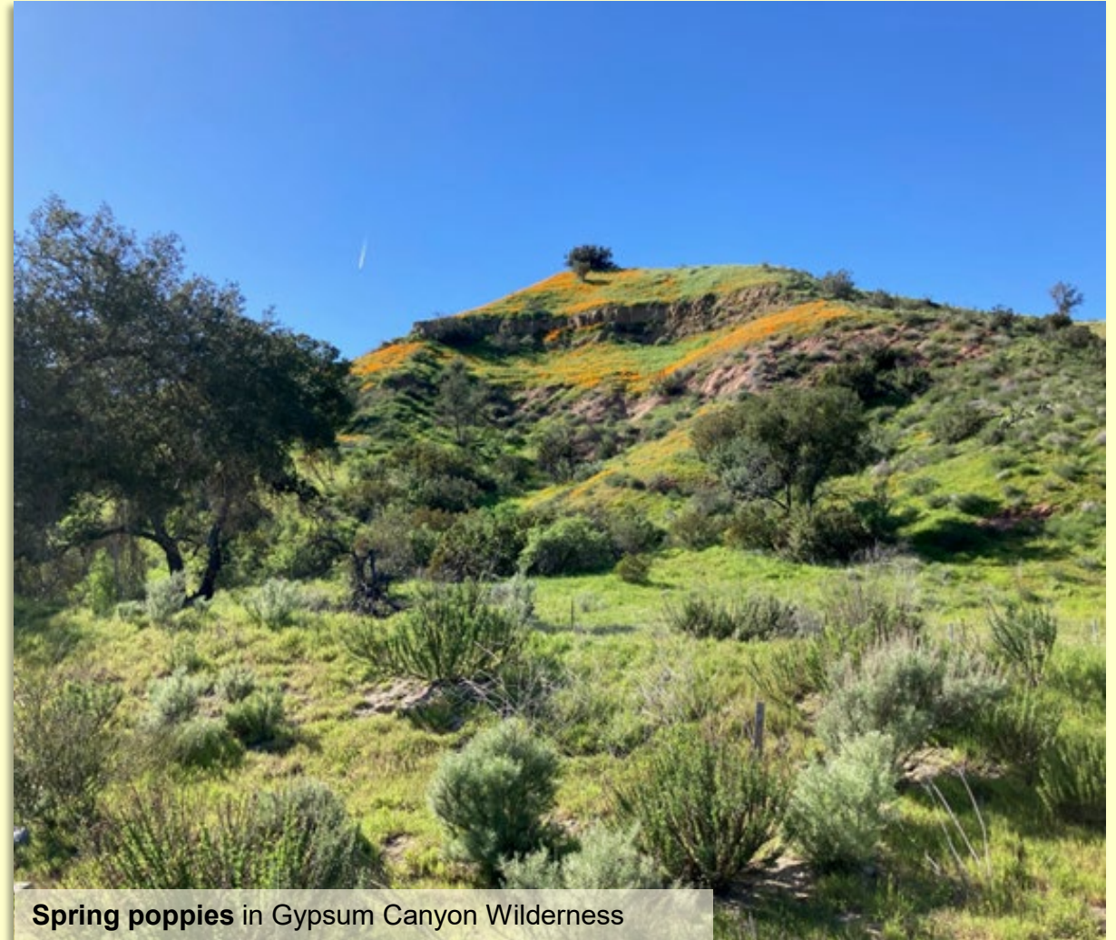
Spring poppies in Gypsum Canyon Wilderness