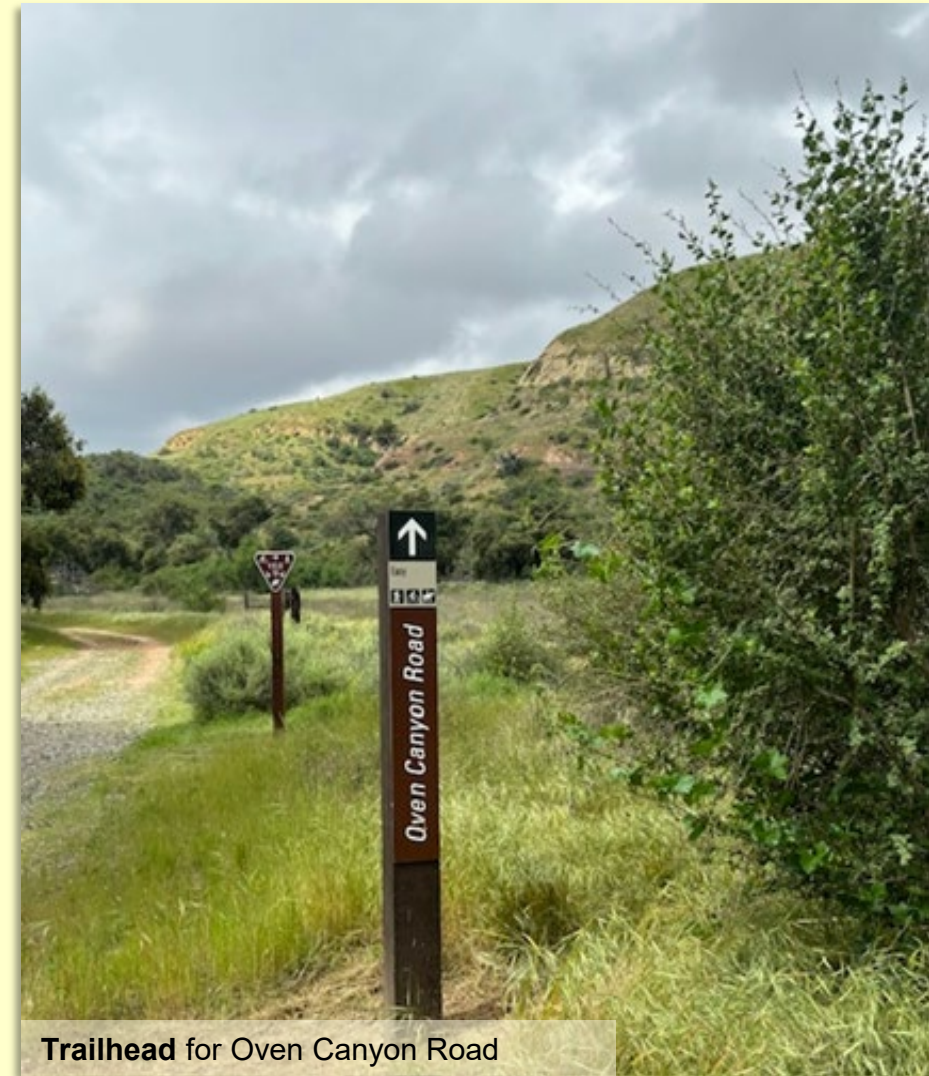
Trailhead for Oven Canyon Road

Can you suggest any trail names or trail naming themes for Gypsum Canyon Wilderness?