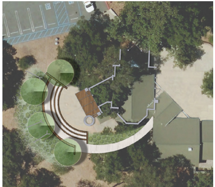
Proposed Amphitheater and Surrounding Area