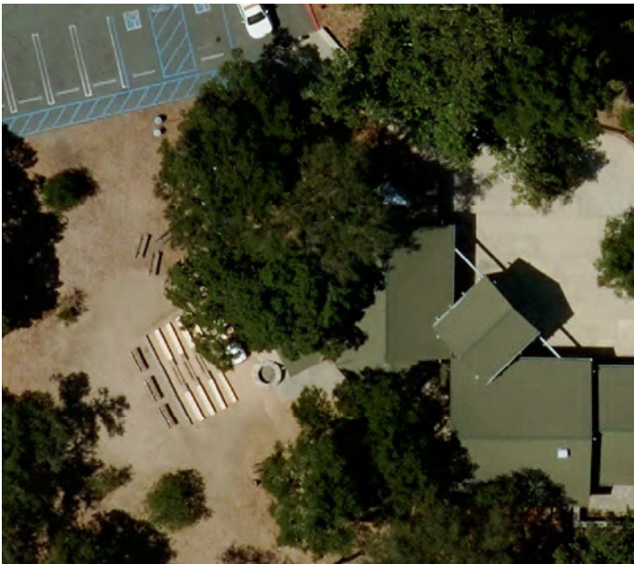
Existing Amphitheater and Surrounding Area

The proposed project increases seating capacity to 120, with access and designated seating in compliance with ADA standards. Pathway lighting will be installed along the tiered seating area, and the site will be regraded to create terraced seating that is adequately sized for all guests. The project also includes native landscape planting to enhance the park’s natural setting, and additional canopy trees will be planted on the periphery of the seating area to provide shade.