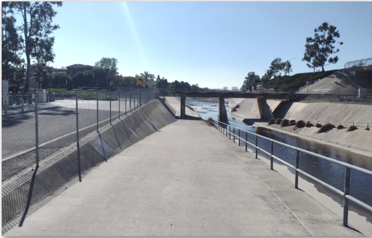
Metrolink railroad undercrossing