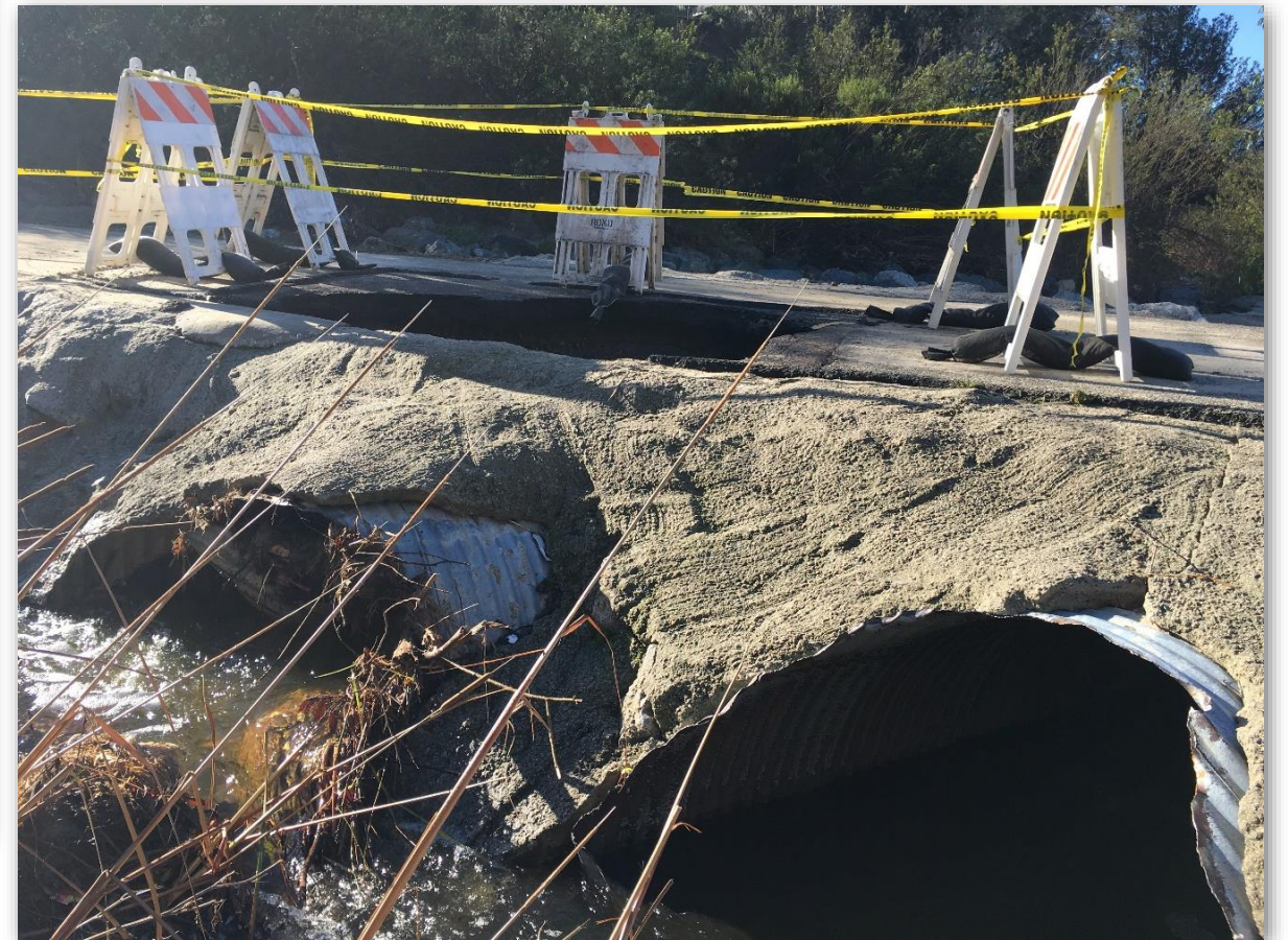
Existing corrugated metal pipe culverts