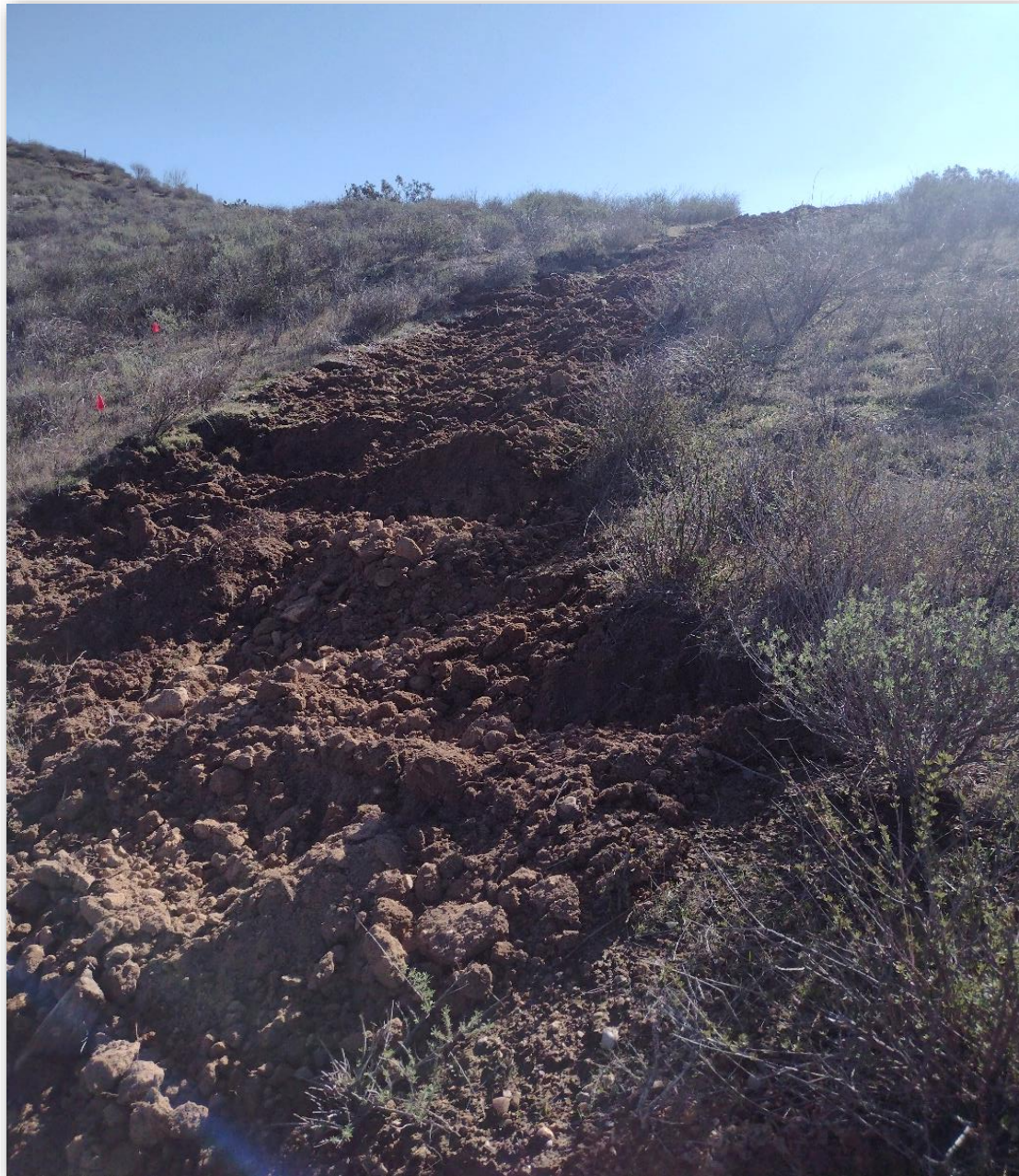
Old trail segment ready for habitat restoration