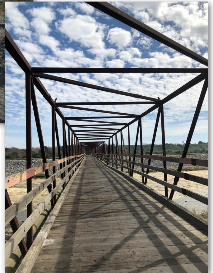
Bridge #3 – Huntington Beach