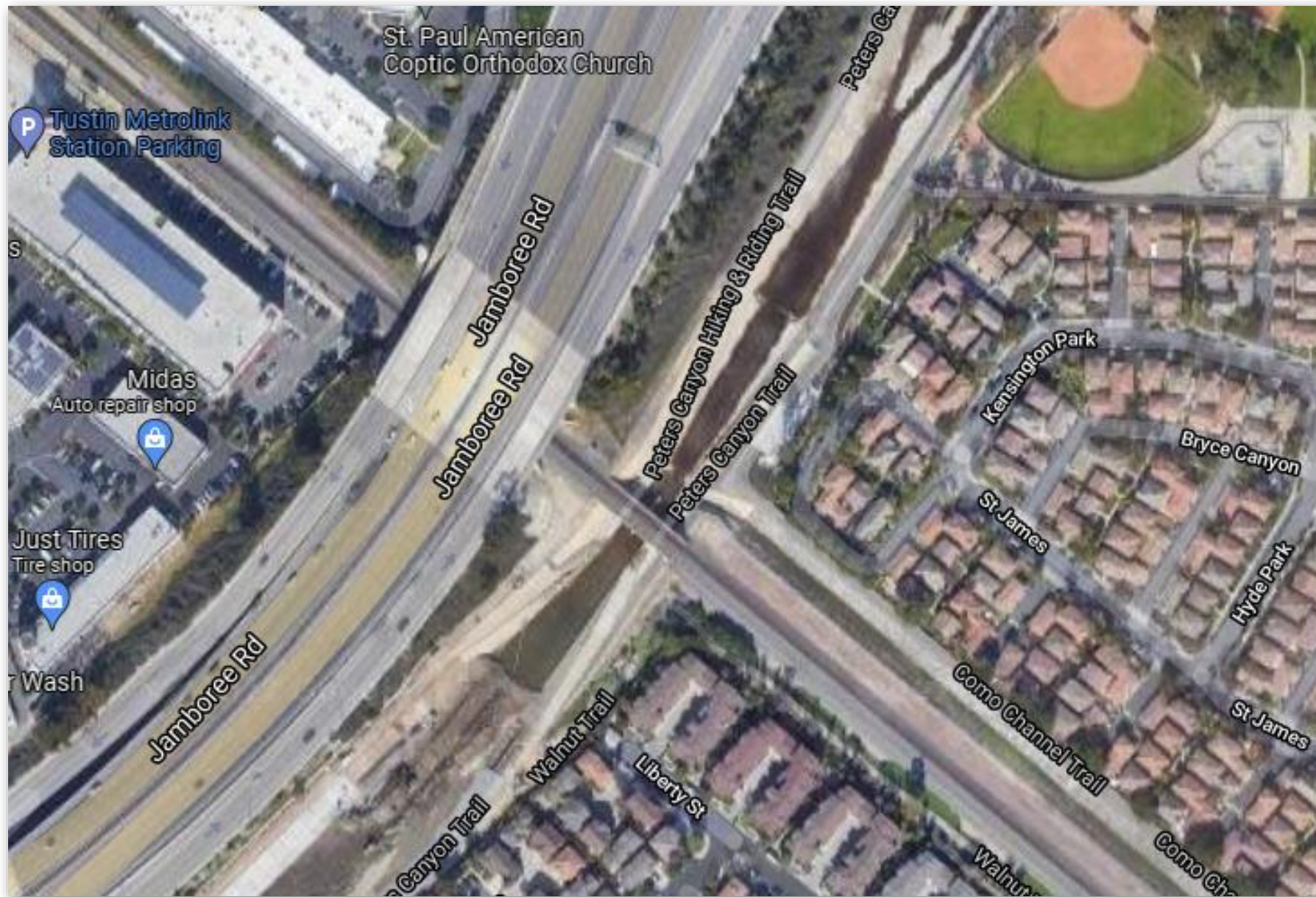
Affected trail segment at railroad crossing