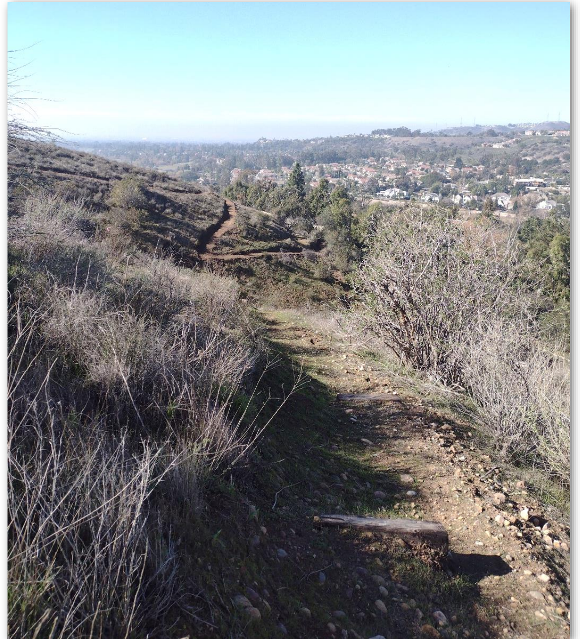
New trail segment with sustainable gradient and outslope