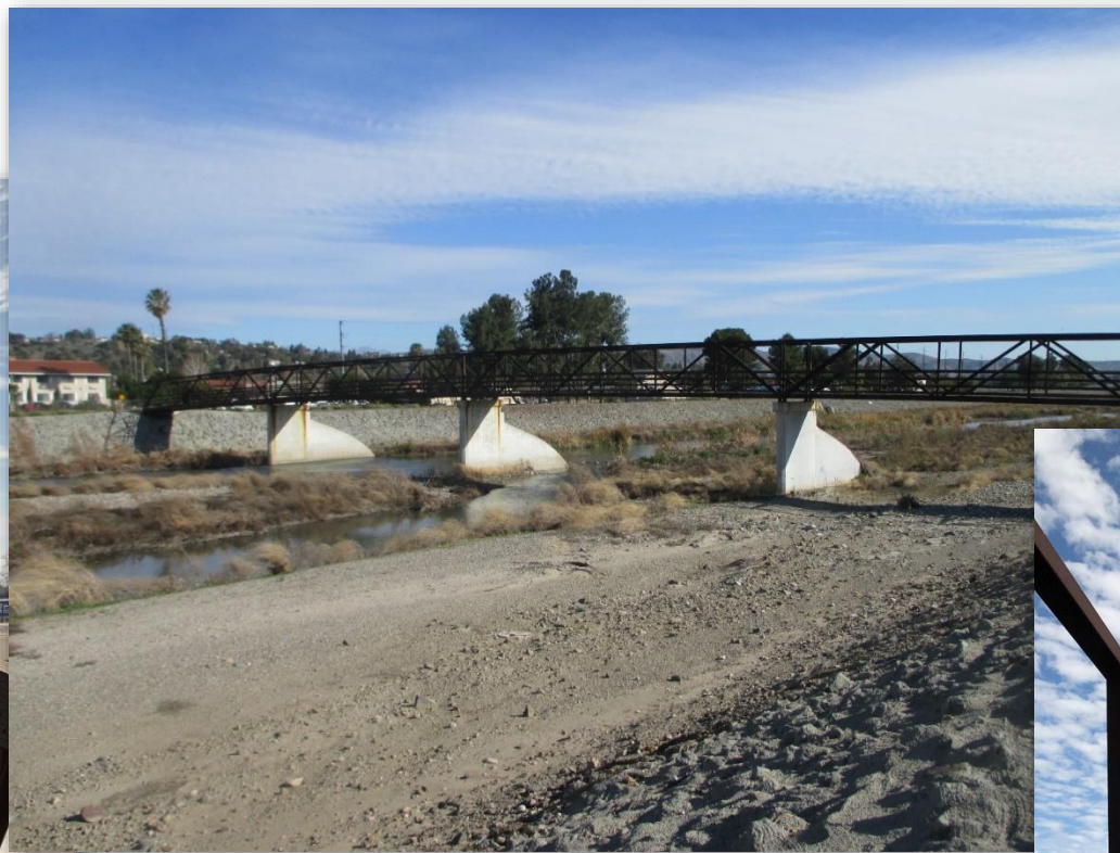
Bridge #2 – Santa Ana