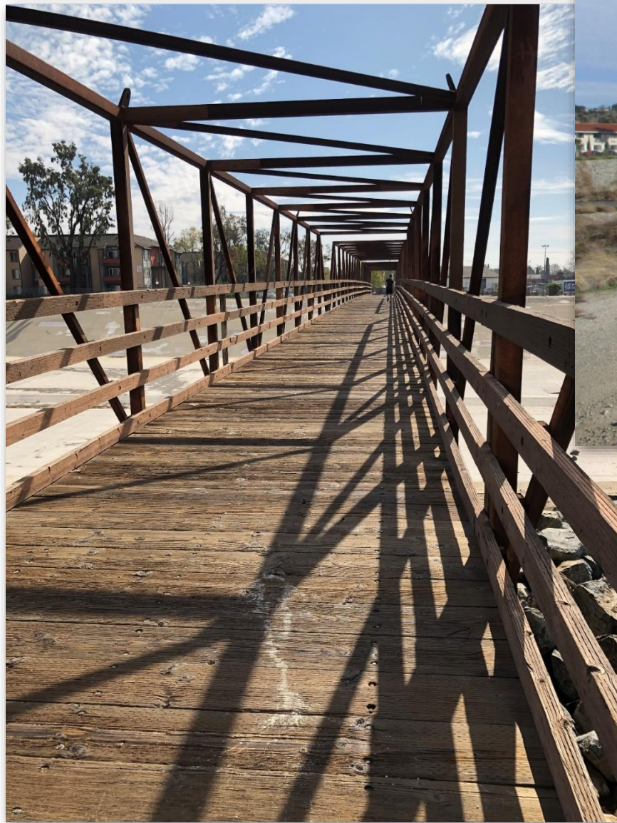
Bridge #1 - Anaheim