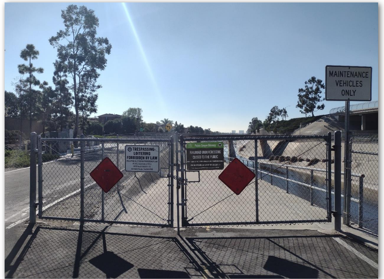
Gate at closed segment