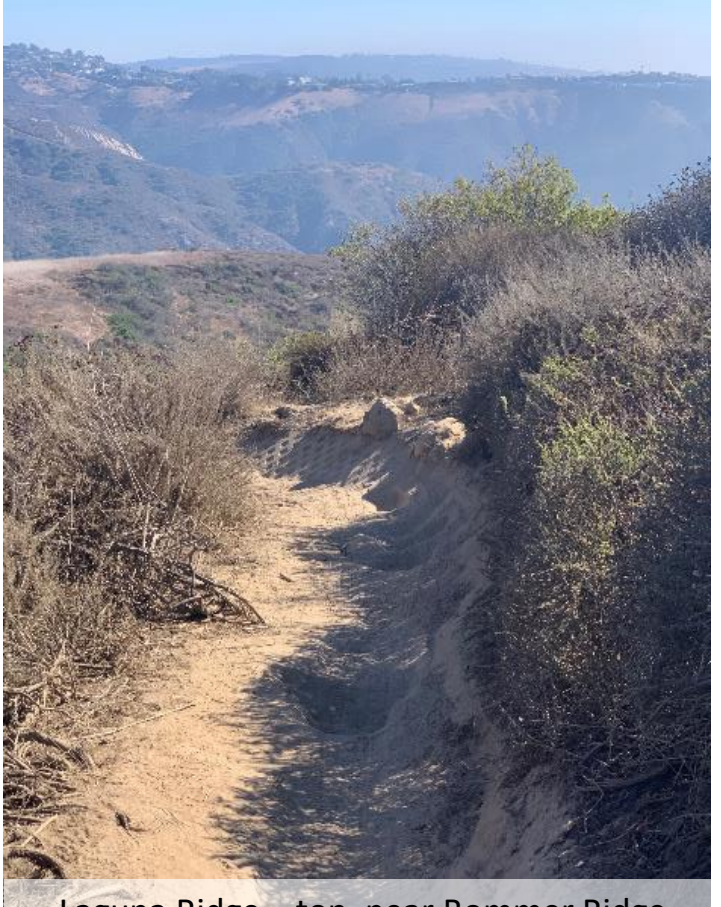
Laguna Ridge – top, near Bommer Ridge

Laguna Ridge Trail provides access from Laguna Canyon Road to the interior of the park, connecting to Bommer Ridge. The portion of the trail nearing the Road is extremely steep. This trail is currently heavily used by bikes going downhill, and limiting it to downhill bikes only is anticipated to reduce potential impacts/safety concerns and crowding while maintaining the user experience enjoyed by many bikers on this trail. There will be no change to the 10mph park speed limit. A nearby trail, Big Bend Trail, runs parallel to Laguna Ridge and can be used by hikers to access the interior of the park north of Laguna Ridge Trail.