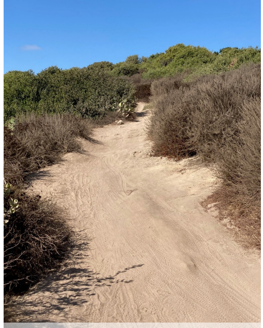
Cholla – bottom third, near Wood Canyon

Cholla and Lynx are parallel trails that connect Wood Canyon and West Ridge. Cholla is heavily used by both hikers and bikers while Lynx is more heavily used by bikes. Limiting Cholla bike travel to uphill only is anticipated to reduce crowding concerns and also maintain, along with the Lynx/Wood Canyon/West Ridge trails, a looped route for bikes in this area of the park.