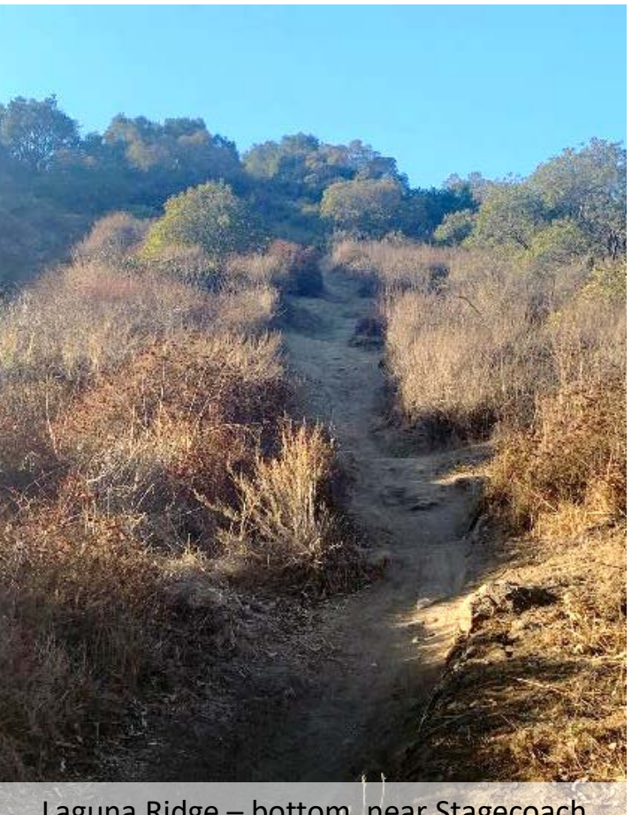
Laguna Ridge – bottom, near Stagecoach

PROPOSED PILOT PROJECT – TRAIL USE DESIGNATIONS