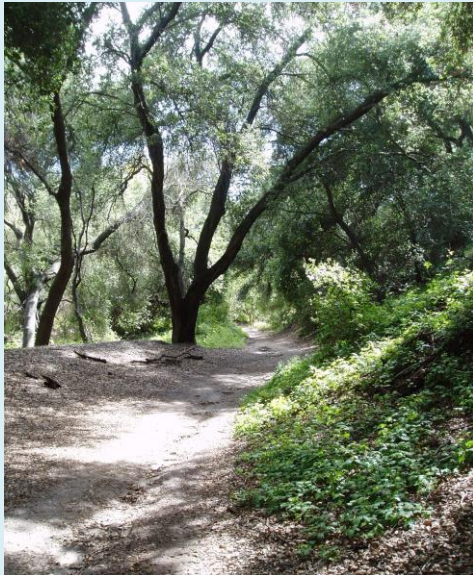
Oak woodlands are one of the protected native habitat types in the NCCP/HCP, Whiting Ranch Wilderness Park