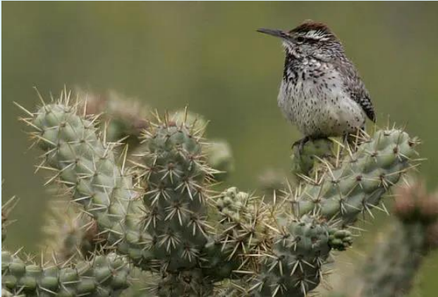
Coastal Cactus Wrens are a target conservation species in the NCCP/HCP