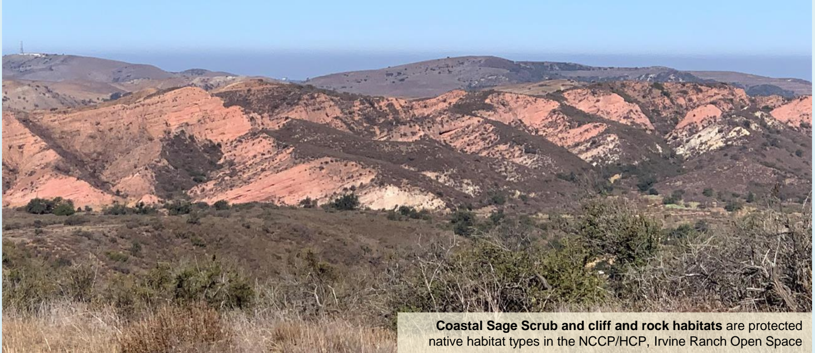
Coastal Sage Scrub and cliff and rock habitats are protected native habitat types in the NCCP/HCP, Irvine Ranch Open Space